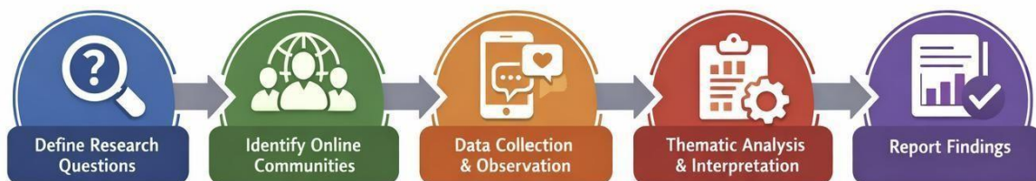
Figure 1. Five Stages of Netnographic Design

The methodological framework of this study is visually summarized in Figure 1 , highlighting the iterative and systematic nature of the netnographic process applied in the analysis.