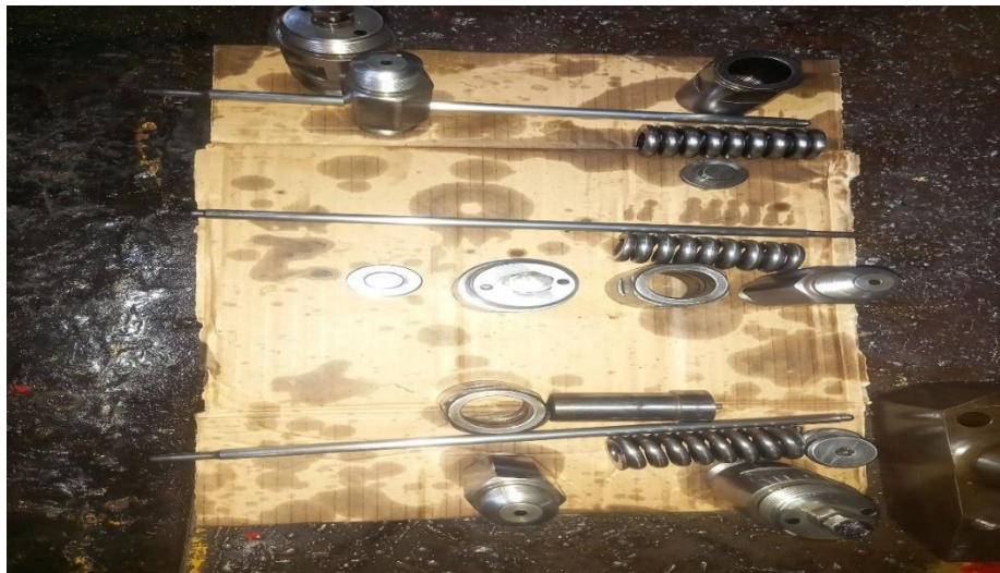
Figure 3. 3 injector components

an injector is a component in an internal combustion engine that functions to spray fuel into the combustion chamber in a controlled manner. Injectors play a key role in the combustion process by ensuring that fuel is optimally blended with the air, resulting in efficient combustion and reducing exhaust emissions.