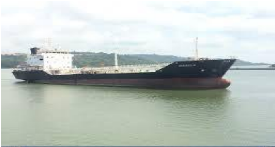
Source: mt ship. Edricko 8

The following are the data from the ship where the author conducted research while carrying out marine practice in mt. Sambu, is as follows: